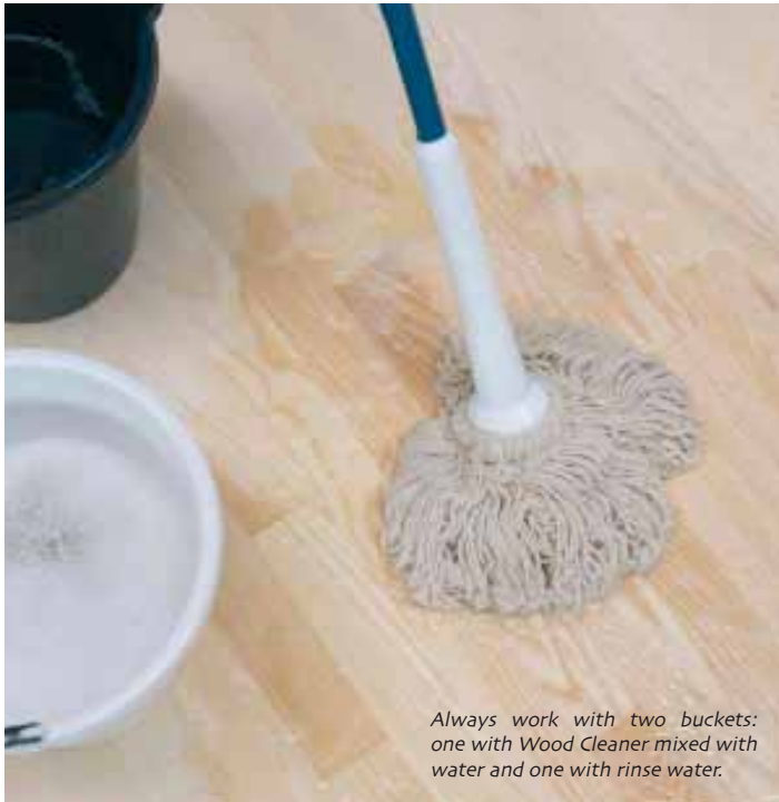
Always work with two buckets: one with Wood Cleaner mixed with water and one with rinse water.

Natural Soap white is recommended for light wood species, while Natural Soap natural is ideal for dark wood. May be used for the cleaning and maintenance of all known oil systems. Natural Soap is a quality soap, which due to its nourishing properties quickly closes the pores of the wood and protects against dirt and penetration of liquids.